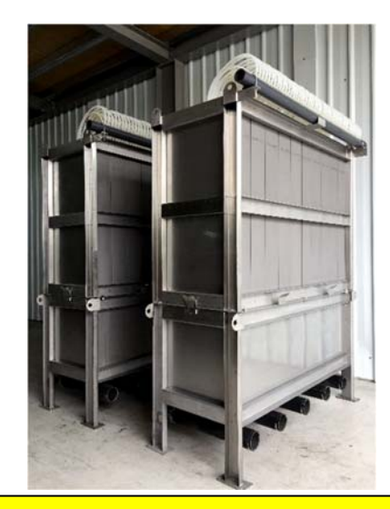
Module support structure that's easy to assemble at local welded factory!