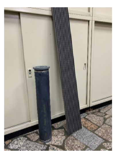
left: Air diffuser; Right: Insert track